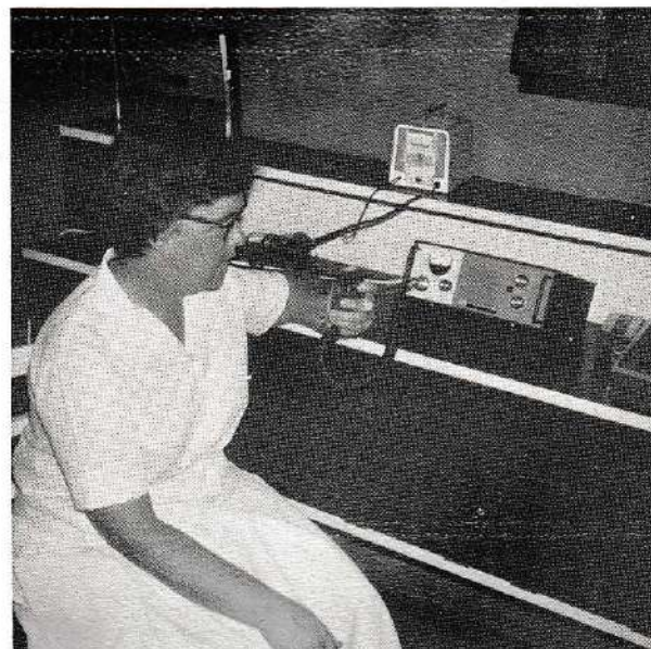
Our radio network links remote medical stations with our plane and the base hospital.

— ALL CONTRIBUTIONS ARE TAX DEDUCTIBLE —