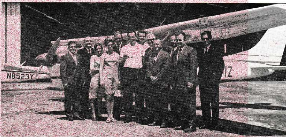
In the Spring of 1969, the NASHVILLE WING sent this Cessna to the Amazon Jungle. Appearing here are supporters from Nashville, Montreal, St. Louis and Iquitos, Peru.