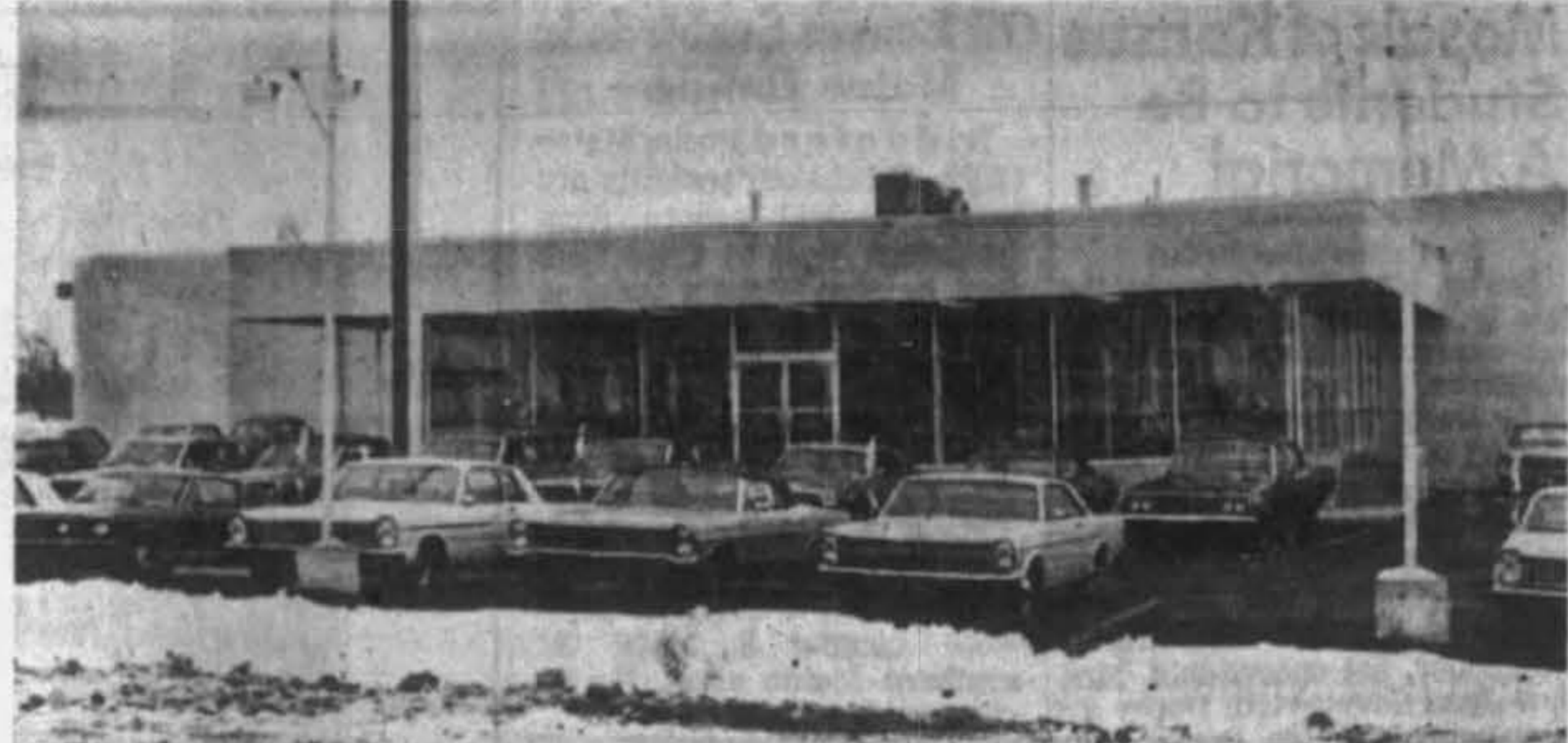
A NEW HOME FOR COURTESY FORD is this building at 600 North U. S. 50 in Lee's Summit. Moving from McGee trafficway and Pershing road, the agency will observe a formal opening Tuesday in its 19,200-square-foot sales and service facility.