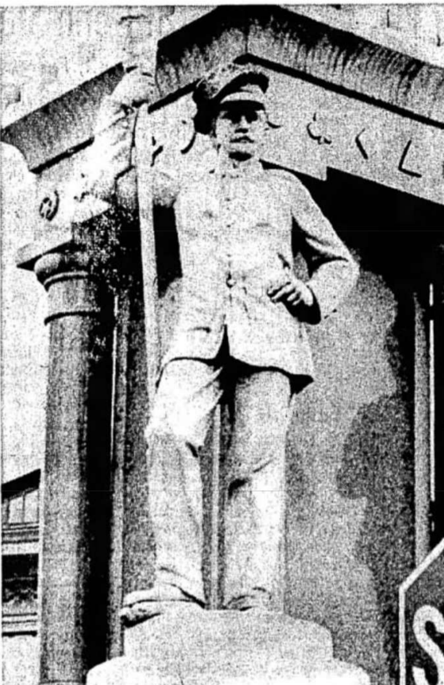
GET THE TROOPS out of the hot sun. Someone followed that order yesterday by placing a straw hat on the artilleryman on the Civil War monument. The hat was gone this morning, but the veteran of '61 still stands firmly.

Success: Something that's determined by determination.